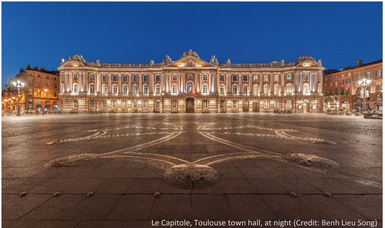
Le Capitole, Toulouse town hall, at night